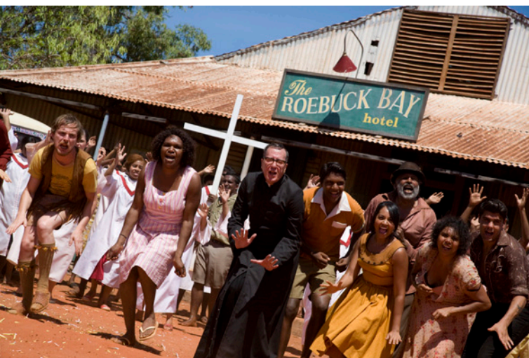
The cast of Bran Nue Dae singing “Nothing I'd Rather Be”

film centred around Aboriginal actors, Samson and Delilah . For further information visit the Bran Nue Dae website .