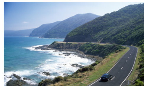
The Great Ocean Road, Victoria.

Want to study in Australia ? Click here for information . Applications are also open for the Endeavour Awards 2011 which offer Australian Government grants to high achieving international students, researchers and professionals.