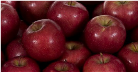
Crimson Snow apples