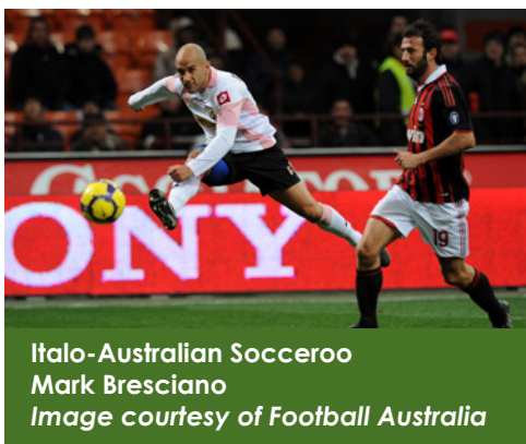
Italo-Australian Soccereroo Mark Bresciano

The major sporting event at the moment is of course the World Cup in South Africa , which saw both Italy and Australia involved. The make-up of the Australian team reveals the country's multicultural nature, and several players with dual nationality have opted to play for Australia.