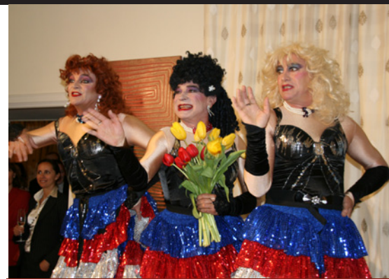
The Fabulous Flag Sisters performing at the “Grazie Italia” reception.

Italy's gold-winning Olympic swimmer, Massimiliano Rosolino , was guest of honour alongside his Italian father and Australian mother. Massimiliano is a perfect example of Italo-Australian sporting links, having